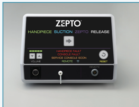
Figure 2. Next Generation Power Console.