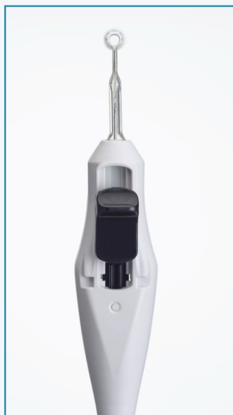
Figure 1. Next Generation Handpiece.